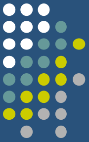
Photo Contest – One of the 120 Entries and Eight Winners